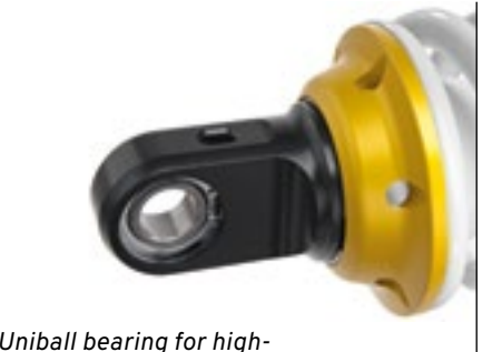
Uniball bearing for highest loads

The slimmer damper design also contributes to the sensitive response. "We rely on a one-piece, milled bottom part for the new Plug & Travel EVO line," Jo Glaser explains. "Compared to the