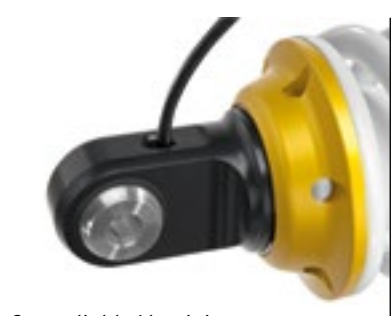
Super light: Aluminium alloy bushes